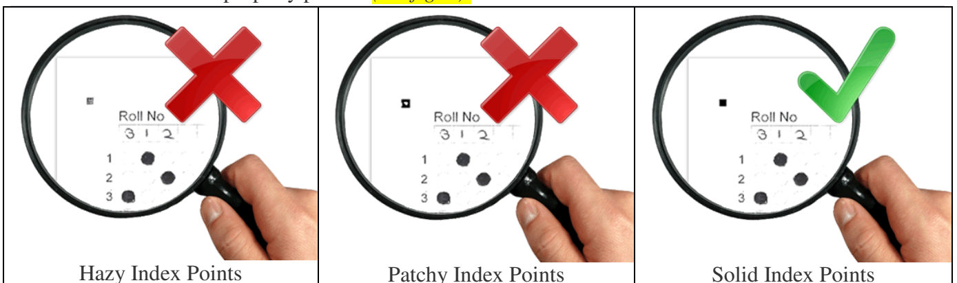
Figure 1 : Perfect Index Point Printing